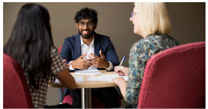
Image: Reading Room, Coral Bell School, Hedley Bull Building

Outstanding ongoing student support, with dedicated student engagement administrators for each program.