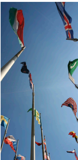
Image: Coral Bell School, Hedley Bull Building

Outstanding ongoing student support, with dedicated student engagement administrators for each program.