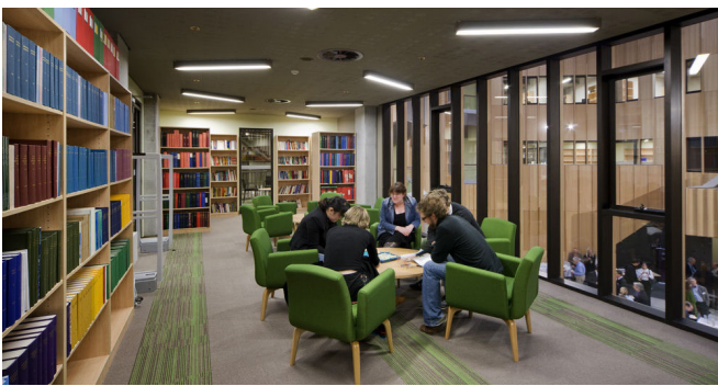
Image: Parliament House, Canberra, Australia

Access to first-class facilities, small class sizes and globally recognised academics as lecturers.